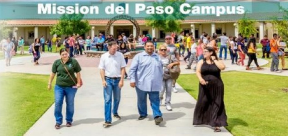
Mission del Paso Campus