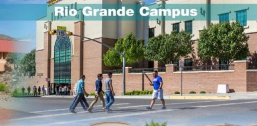
Rio Grande Campus