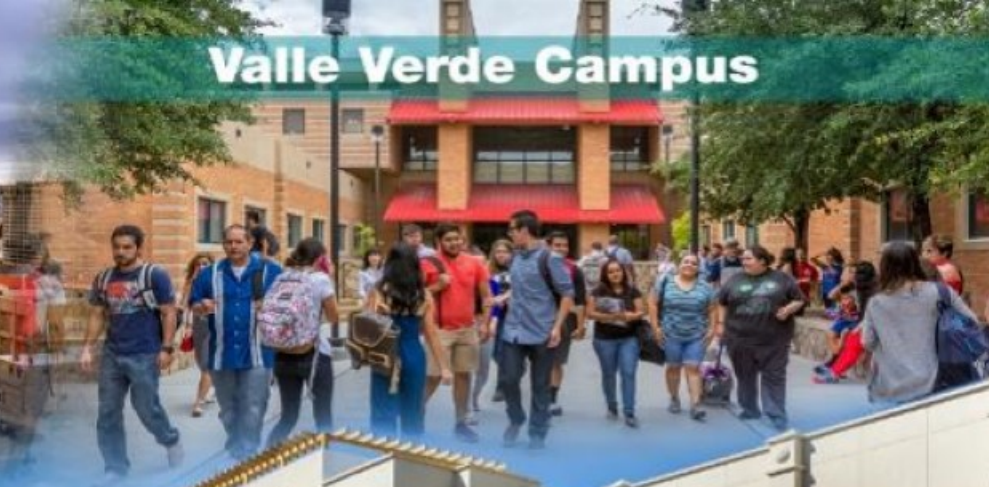
Valle Verde Campus