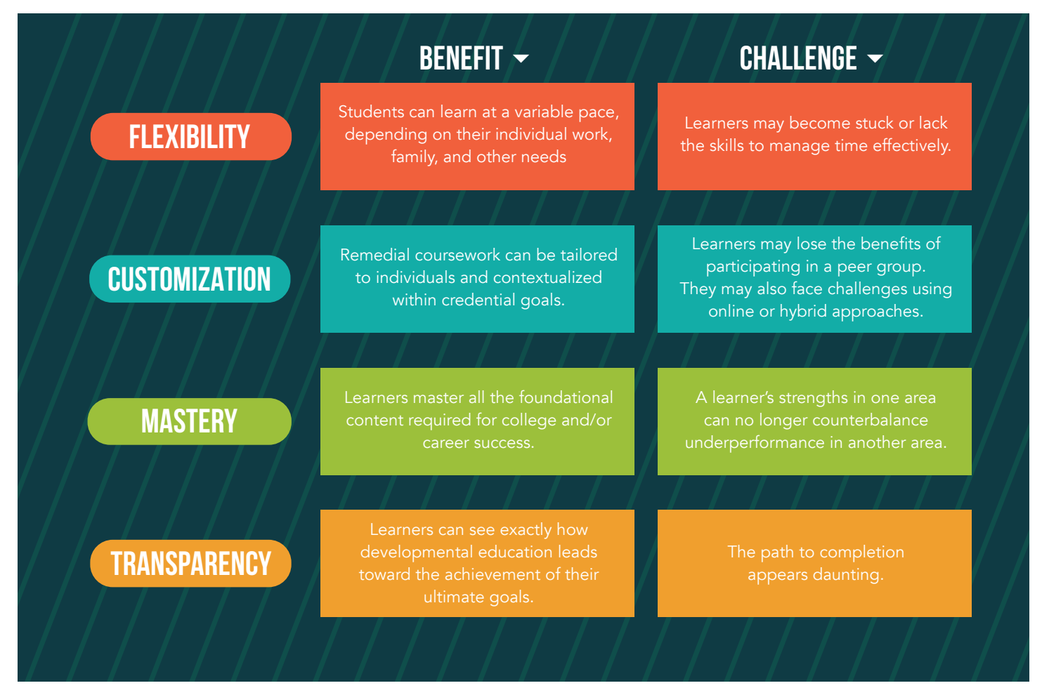
Figure 1: BENEFITS AND CHALLENGES OF CBE FOR UNDERPREPARED LEARNERS

Further, at community colleges that implement compressed developmental sequences that stack multiple developmental classes into one semester, students face acceleration challenges. <sup>16</sup> Pacing in these courses is tied to the length of the term. A learner who falls behind will likely have greater difficulty catching up than in traditionally paced classes. Meanwhile, without any way to account for prior learning within the course, students who enter with stronger skills in one area may be forced to repeat content that they already know.