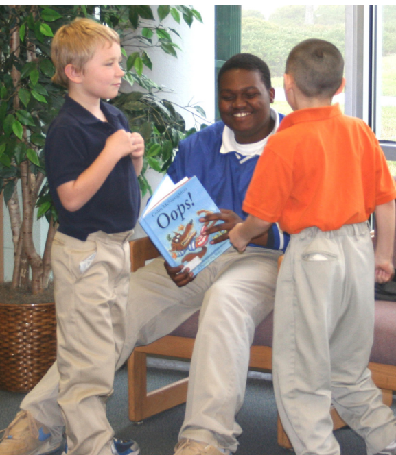
An Anson County Early College student reads with children from a nearby elementary school as part of his community service, a major component of the program for all Anson early college students.

the school's postsecondary partner, Asheville-Buncombe Technical Community College, the high school teachers collaborate with college professors and, in some cases, attend their students' college courses.