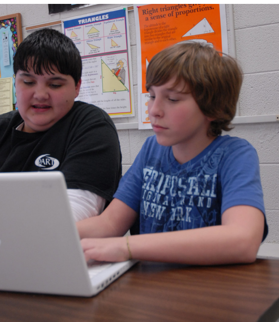
Davidson County Early College students work together in a math classroom.