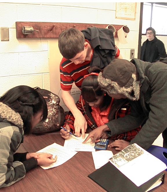
Students at Vance County Early College High School engage in group discussion.