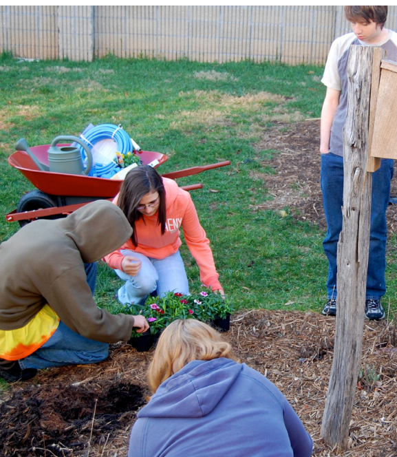
Buncombe County Early College students plant spring flowers in the school's garden as part of their earth and environmental science course. The small community garden also produces tomatoes, peppers, and other produce to benefit the needy.