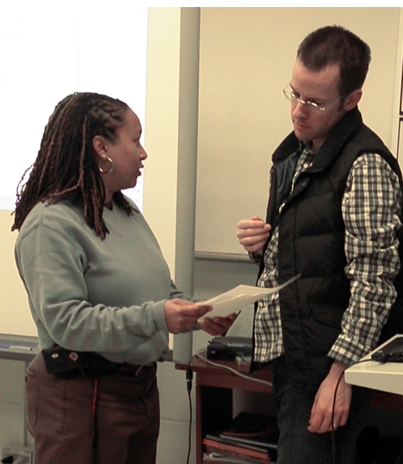
Teachers collaborate closely at Vance County Early College High School and at all of North Carolina's Innovator early colleges.