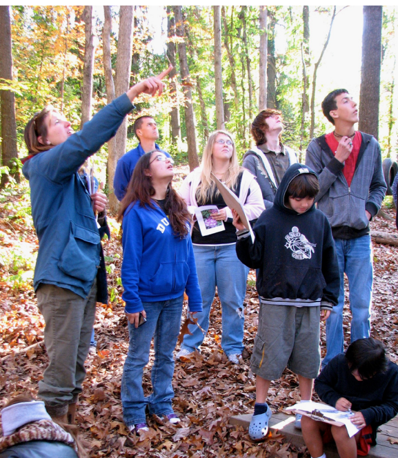
Buncombe County Early College students taking environmental biology for college credit lead local elementary school children on a tour of nature trails on the campus of Asheville-Buncombe Technical Community College.